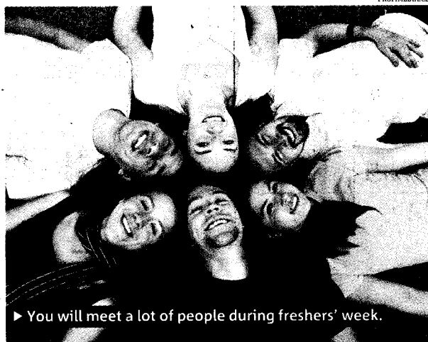
► You will meet a lot of people during freshers' week.

1 New students starting their time at university are known as freshers and freshers' week is a UK university tradition. It's an introductory week for the new students to find their way around and get to know what student life has to offer. The official purpose of freshers' week is for all students to register for their course and organise their timetables as well as to help them settle into their new accommodation. There's also another purpose: it's a great opportunity to really